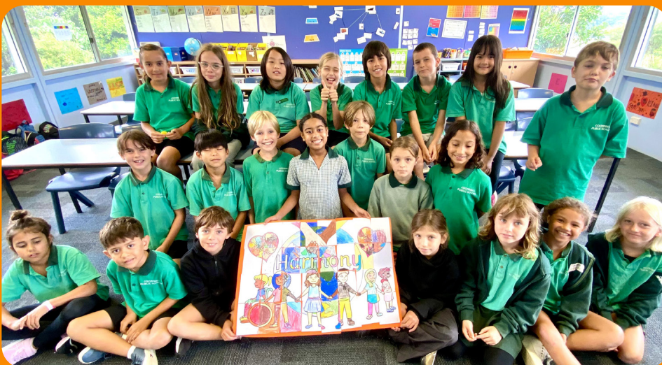
Year 3/4 worked together to create a beautiful Harmony Day artwork.