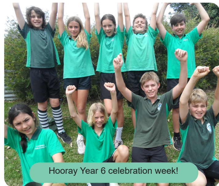
Hooray Year 6 celebration week!