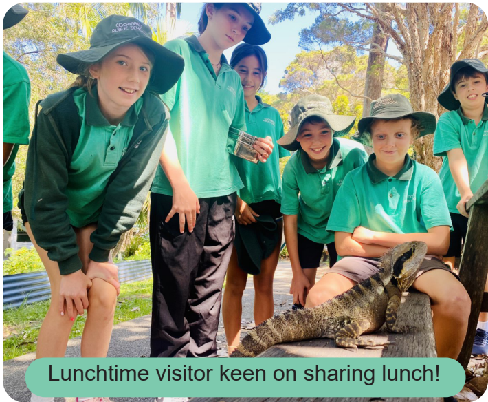
Lunchtime visitor keen on sharing lunch!