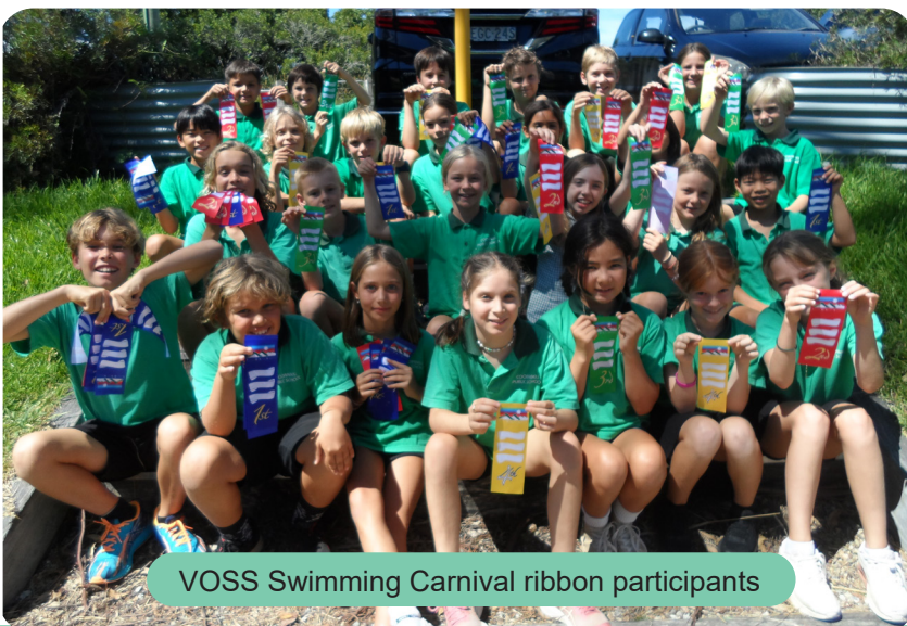
VOSS Swimming Carnival ribbon participants

Coorabell P.S. is a proud member of Lighthouse Valley Learning Community