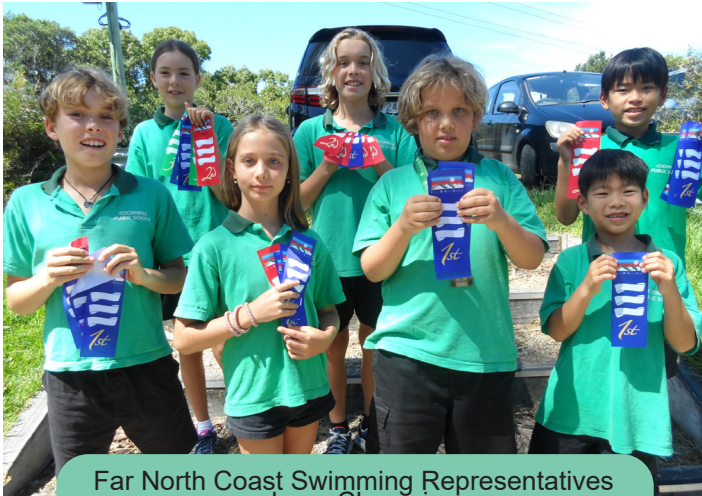
Far North Coast Swimming Representatives and age Champions