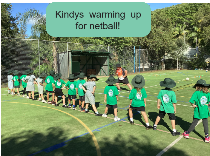
Kindys warming up for netball!