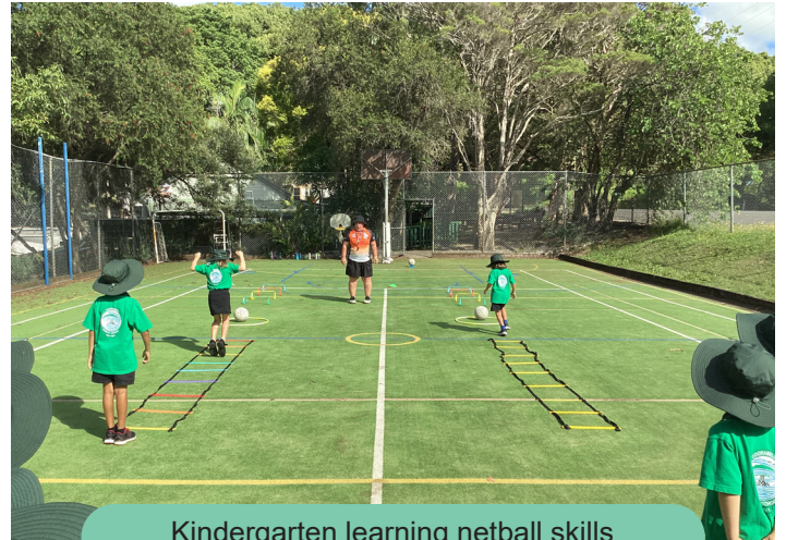
Kindergarten learning netball skills