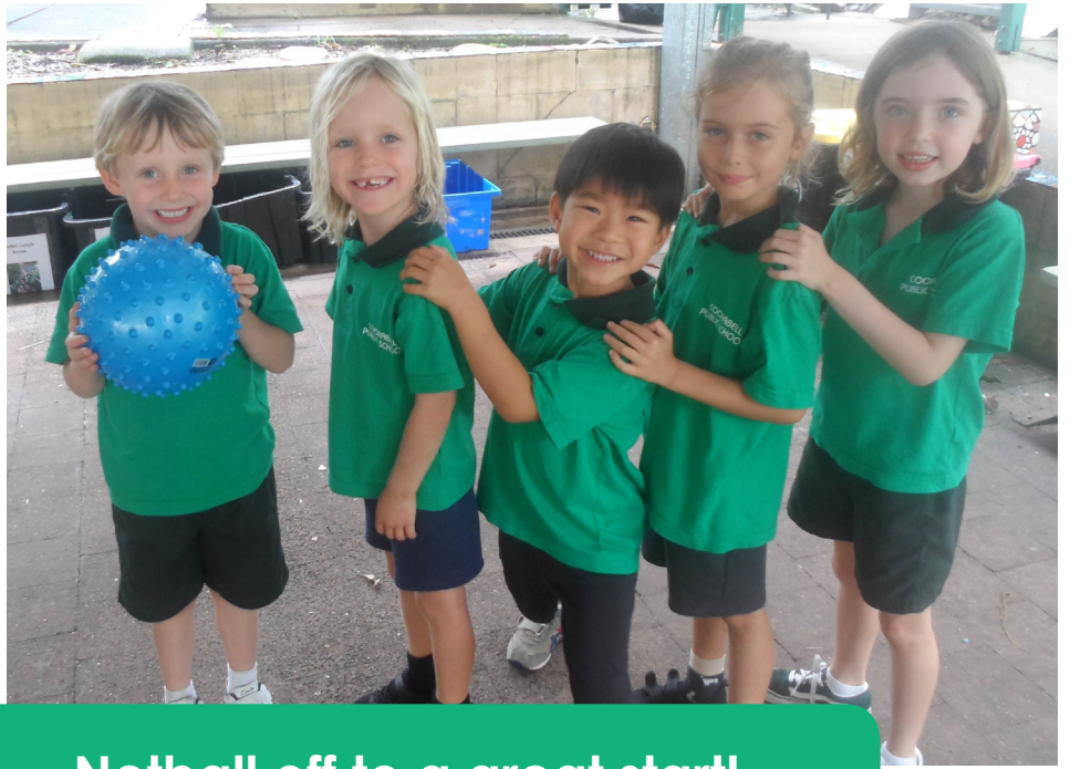
Netball off to a great start!