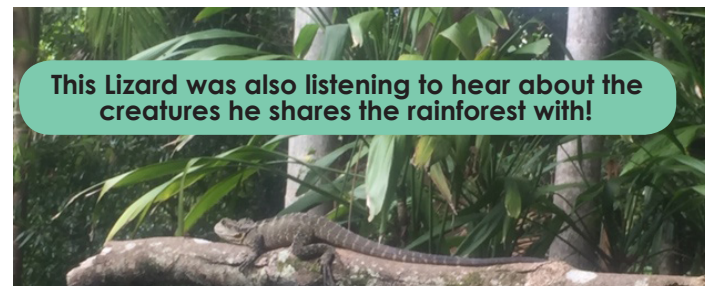
This Lizard was also listening to hear about the creatures he shares the rainforest with!