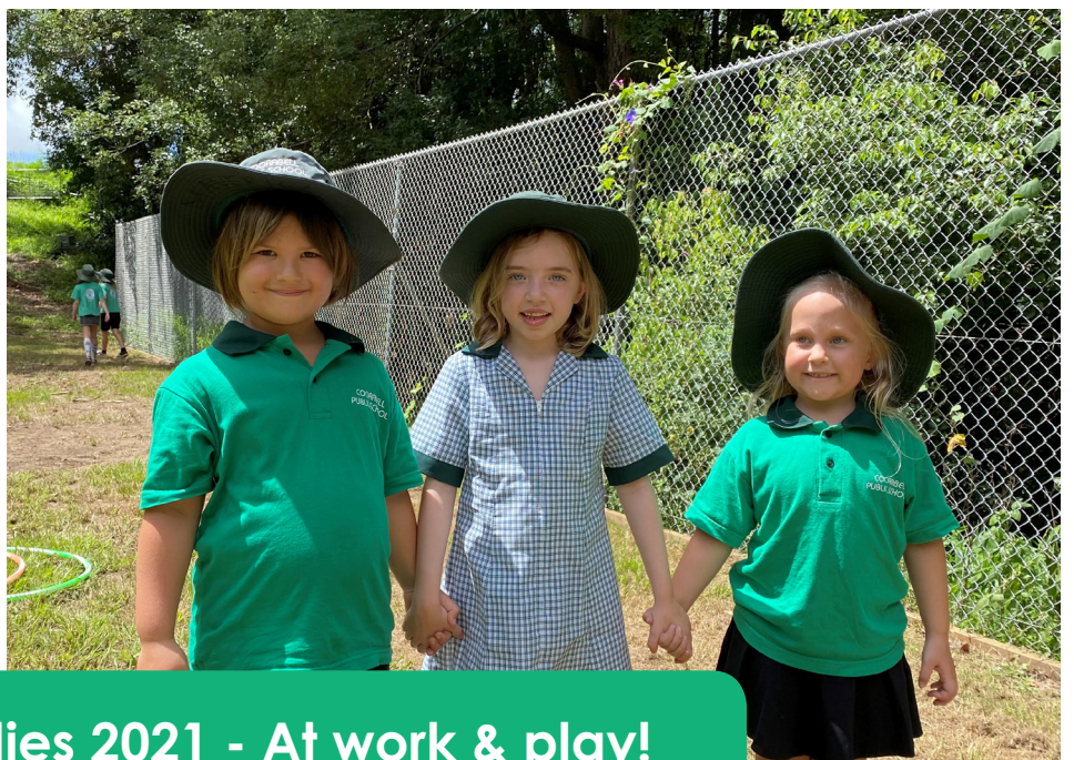
Kindies 2021 - At work & play!