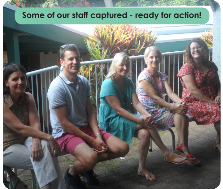
Some of our staff captured - ready for action!

NO Friday Assemblies until further notice due to departmental COVID restrictions