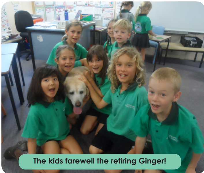
The kids farewell the retiring Ginger!

Our Valley of Small Schools swimming carnival will be held on Tuesday 9th February at Mullumbimby swimming pool. This special event is for children turning 8 years and older this year. A bus will be provided to transport the kids to and from the event with a start time of 9.45am and finishing in time for the afternoon buses from school. However, if children wish to swim the 100m freestyle then they will need to be dropped at the pool at 9am. The 100m race will begin at 9:15am. Unfortunately due to COVID restrictions parents are unable to attend the carnival this year. (continued over page)