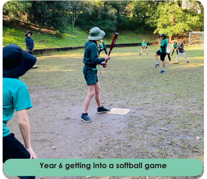
Year 6 getting into a softball game