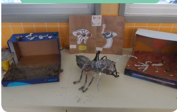
Class 4/5 Desert dioramas