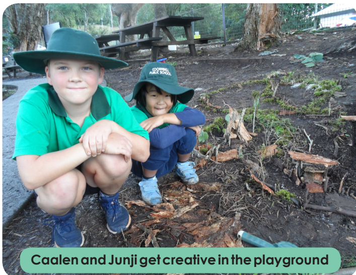
Caalen and Junji get creative in the playground

While it has been raining and the oval has been a little too wet to play on, the students have