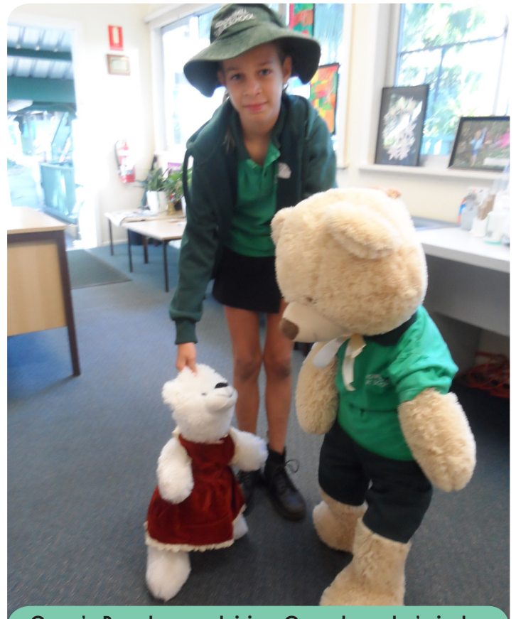
Coco's Berrybear advising Coorabear he's just a little too close!

It would appear that most students and families have endured such unusual times with remarkable resilience. The work being completed in the home learning packs is of very high quality. Please remember that student welfare and family wellbeing far outweigh any perceived obligation to complete all activities. However, one issue that some teachers have identified is that students are claiming that they have completed all work assigned and then parents have been remarking that their children have not been given enough work. When the teachers check their home learning packs it appears that many of the assigned activities have in fact not been completed at all. I have no problem with learning packs remaining incomplete if this is causing your family duress but please check that your children have in fact completed all work assigned to them before approaching teachers for additional material. If your children have finished all assigned activities there is a myriad of online activities/programs that we have recommended to keep your child adequately engaged in learning.