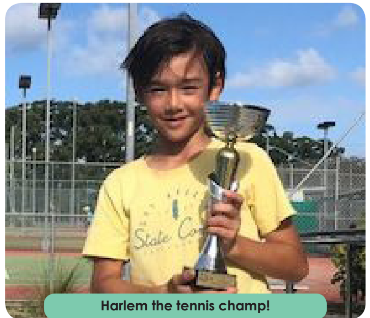
Harlem the tennis champ!

From today the Department of Education is asking for school assemblies to be postponed and also all interschool sporting events have been postponed. Therefore our school assembly set down for this Friday will not be held and