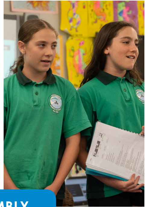
YEAR 6 FAREWELL ASSEMBLY