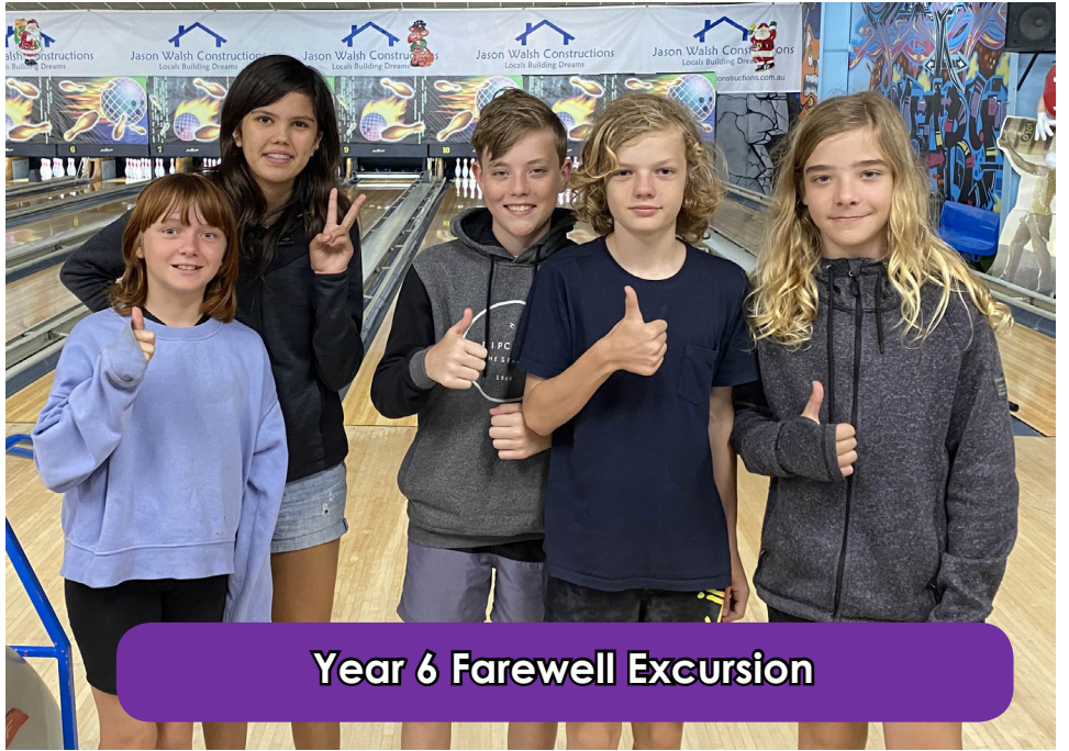
Year 6 Farewell Excursion