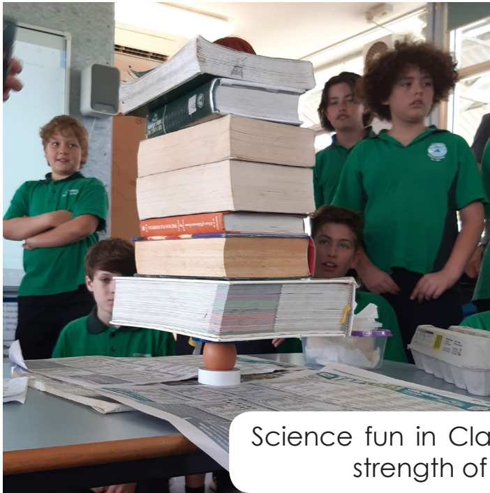
Science fun in Class 3/4 testing the strength of eggshells