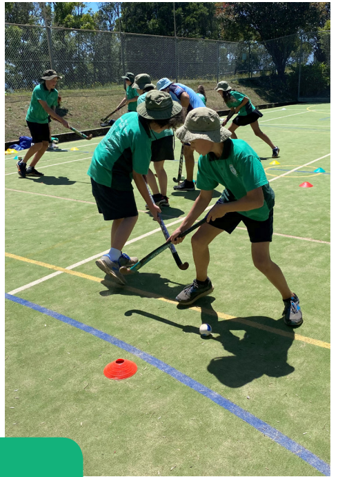
Hockey 1, Hockey 2, Hockey 3