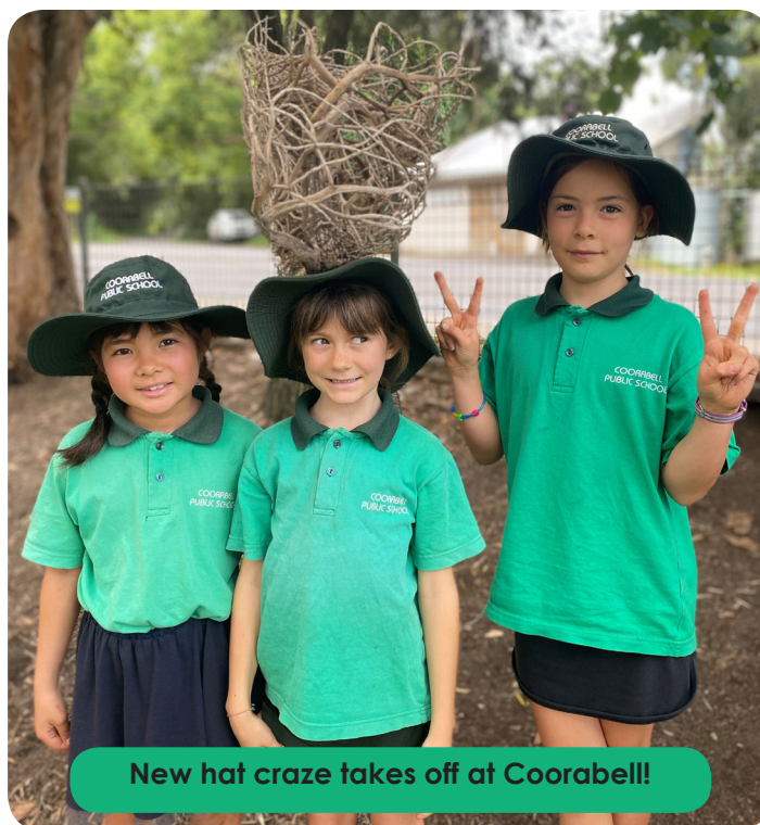
New hat craze takes off at Coorabell!