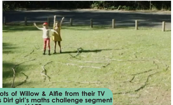
Some still shots of Willow & Alfie from their TV debut on ABC's Dirt girl's maths challenge segment MAZE