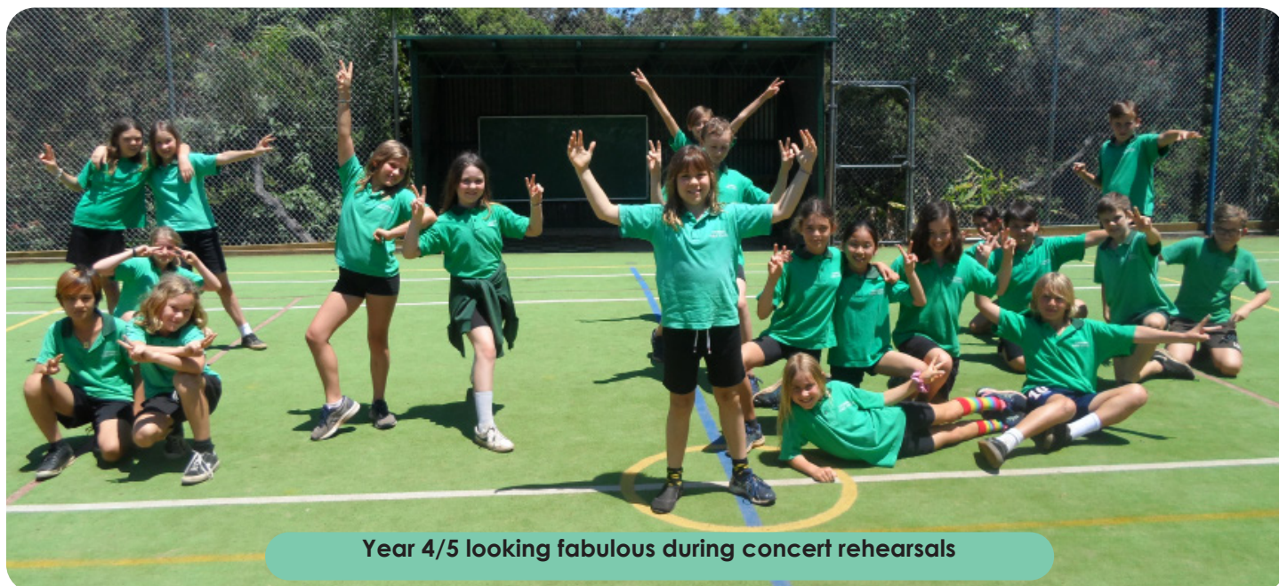
Year 4/5 looking fabulous during concert rehearsals