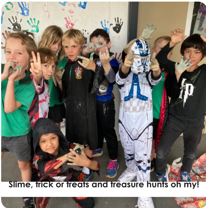
Slime, trick or treats and treasure hunts oh my!