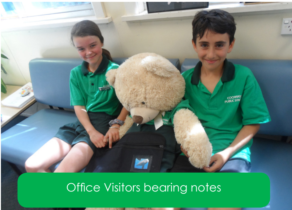
Office Visitors bearing notes