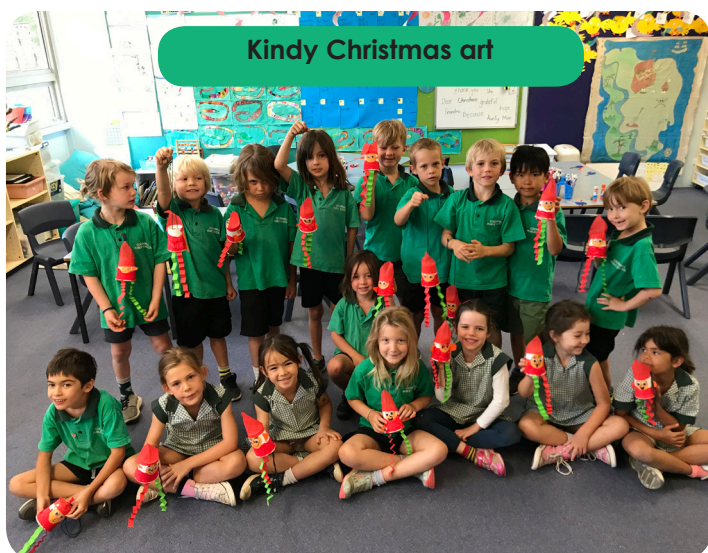
Kindy Christmas art