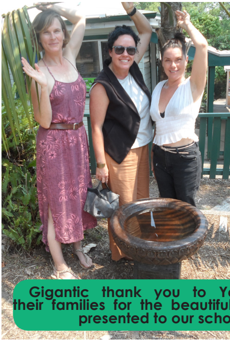
Gigantic thank you to Year 6 & their families for the beautiful bird bath presented to our school