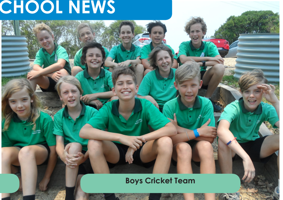
Boys Cricket Team