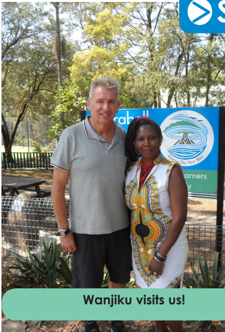
Wanjiku visits us!